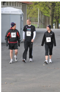
"It is great being able to ride with my friends" ~BG