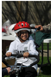
"I smile all the time while riding!" -FB